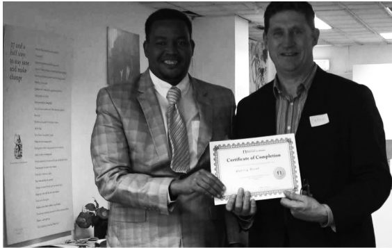
Graduation: Green Party Leader Eamon Ryan TD awarding me the certificate for my Irish Politics and History course.