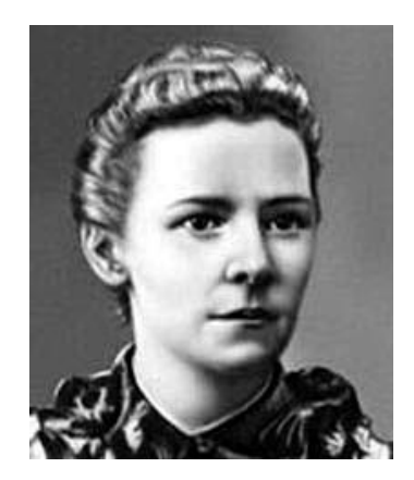
Ethel Lilian Boole/Voynich